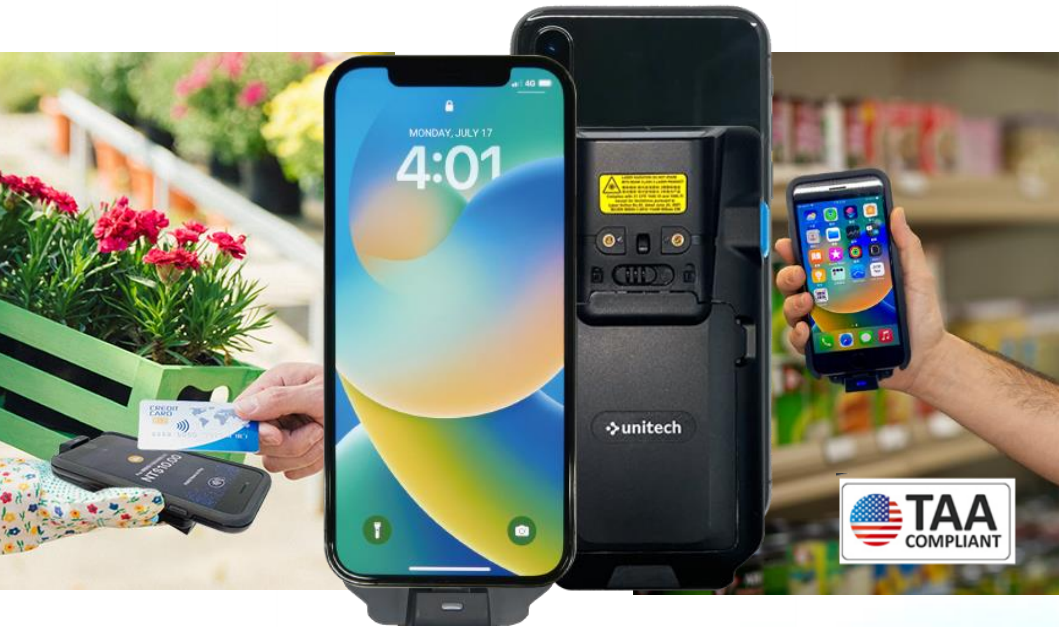
SL220 iOS Sled Barcode Scanner